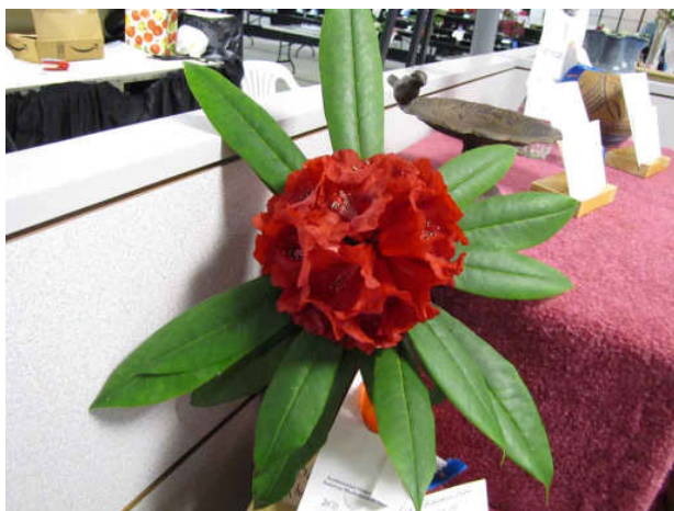
Best Red—Red Majesty