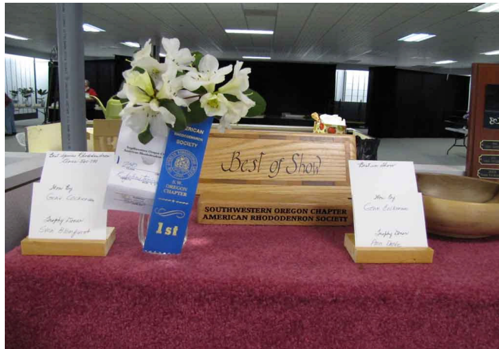
Best of Show—johnstoneanum