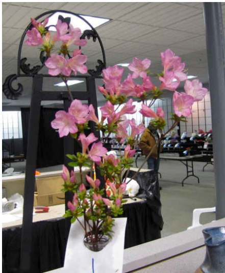
Best Pink Azalea—Unknown