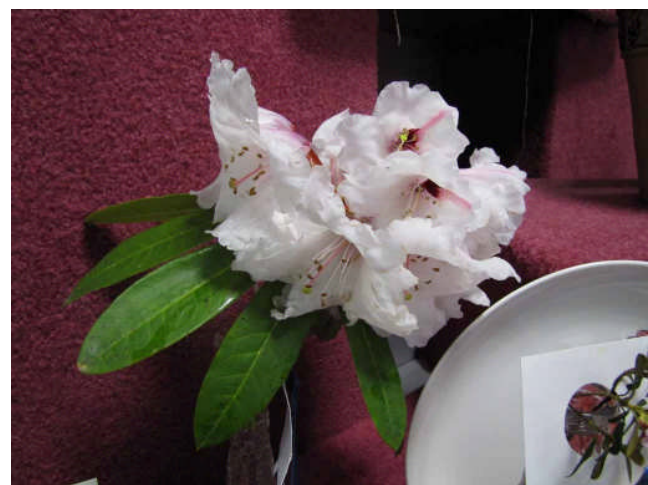
Best White—Exbury calstocker